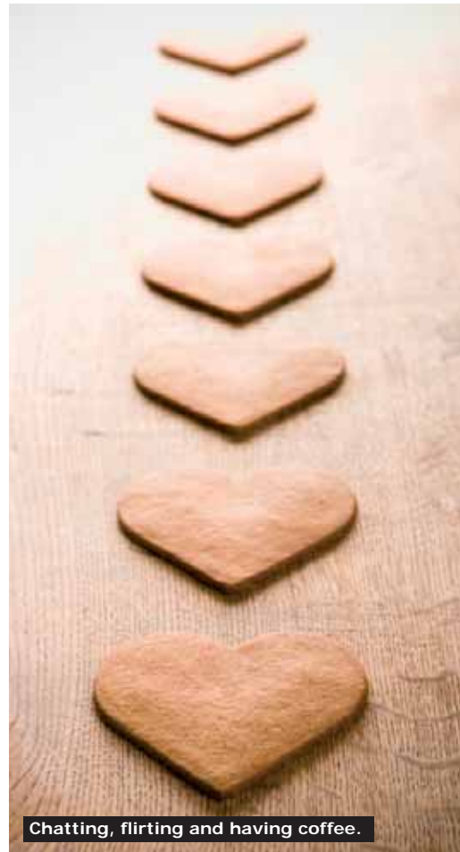
Chatting, flirting and having coffee.