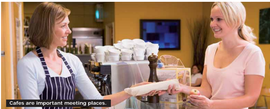
Cafes are important meeting places.